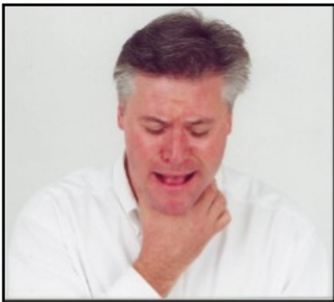
Figure 3: Universal choking sign

In the conscious person who has inhaled a foreign body, there may be extreme anxiety, agitation, gasping sounds, coughing or loss of voice. This may progress to the universal choking sign, namely clutching the neck with the thumb and fingers (as shown in Figure 3).