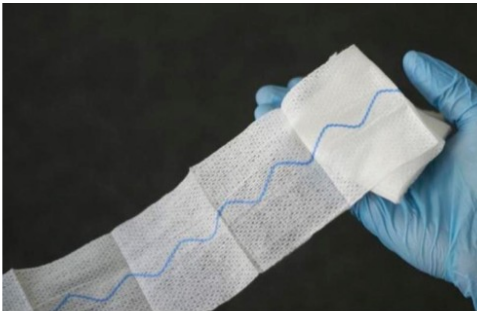
Figure 2: Kaolin impregnated gauze (an example of a haemostatic dressing)

The need to control the bleeding is paramount. The risks associated with the first aid use of tourniquets and haemostatic dressings are less than the risk of uncontrolled severe, life-threatening bleeding. These adjuncts provide temporary bleeding control and rapid transfer to hospital remains critically important.