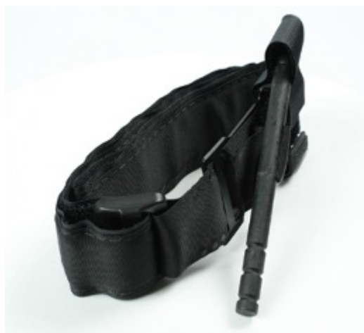
Figure 1: Combat Application Tourniquet