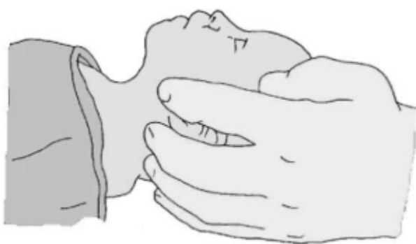
Figure 2: Infant in neutral position

In an infant, the upper airway is easily obstructed because of the narrow nasal passages, the entrance to the windpipe (vocal cords) and the trachea (windpipe). The trachea is soft and pliable and may be distorted by excessive backward head tilt or jaw thrust. Therefore, in an infant the head should be kept neutral and maximum head tilt should not be used (Figure 2). The lower jaw should be supported at the point of the chin while keeping the mouth open. There must be no pressure on the soft tissues of the neck. If these manoeuvres do not provide a clear airway, the head may be tilted backwards very slightly with a gentle movement. [Good practice statement]