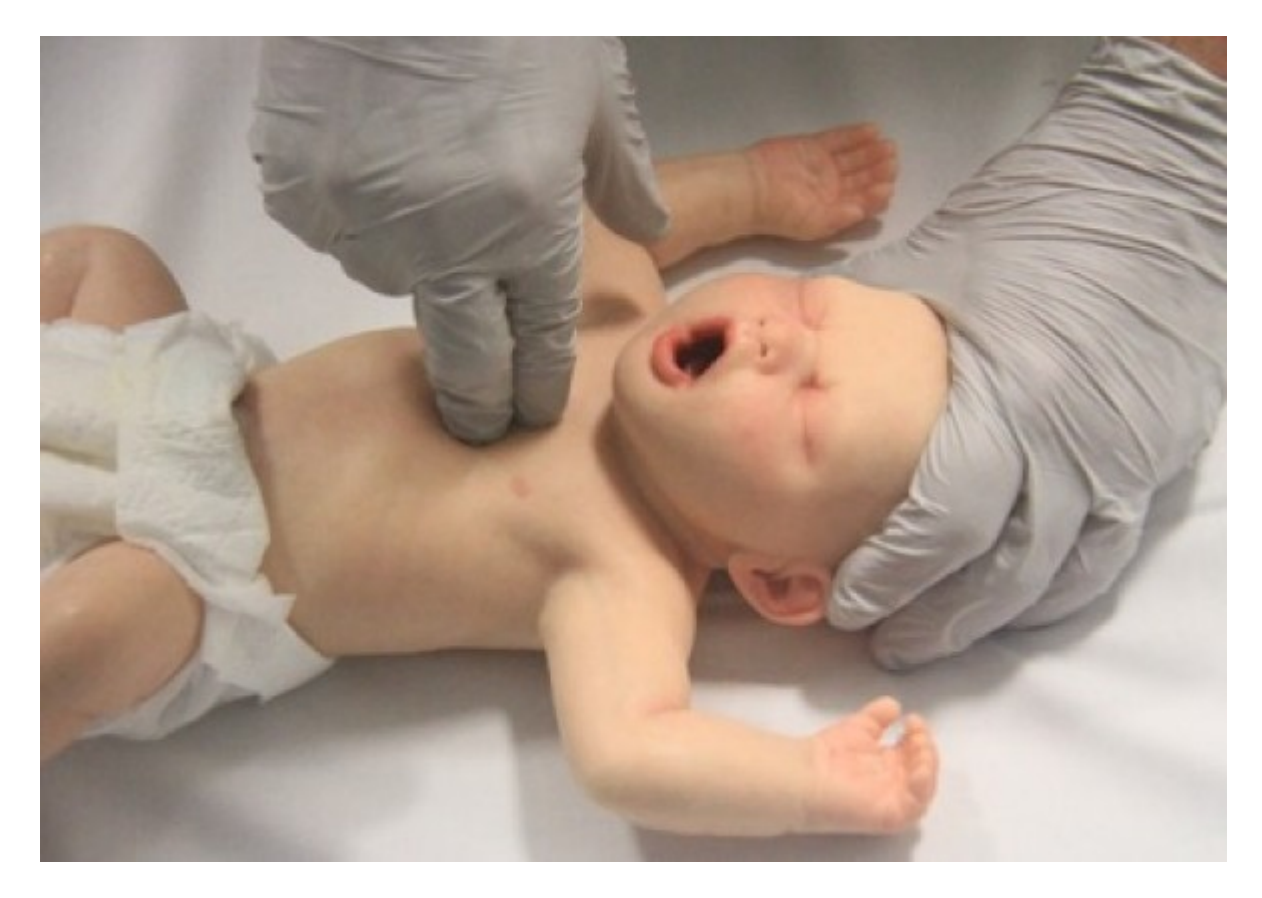
Figure 7: Two-finger technique in infant