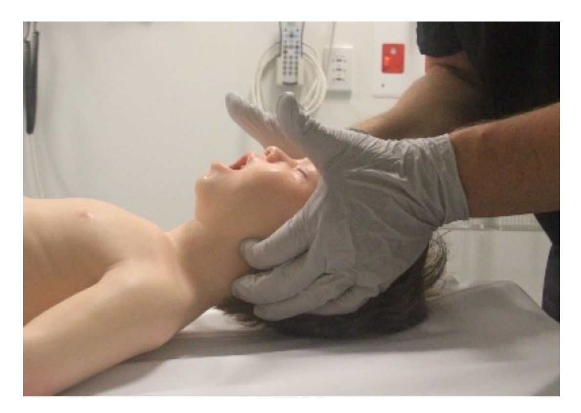
Figure 4: Jaw thrust in a child

The patency of the airway may be assessed by observation of movement of the chest and abdomen during breathing (LOOK), listening for breath sounds from the mouth or nose (LISTEN), and feeling for air movement on the rescuer's cheek (FEEL) (Figure 5). An indrawing of the chest wall and/or distension of the abdomen with each inspiratory effort without expiration of air implies an obstructed airway.