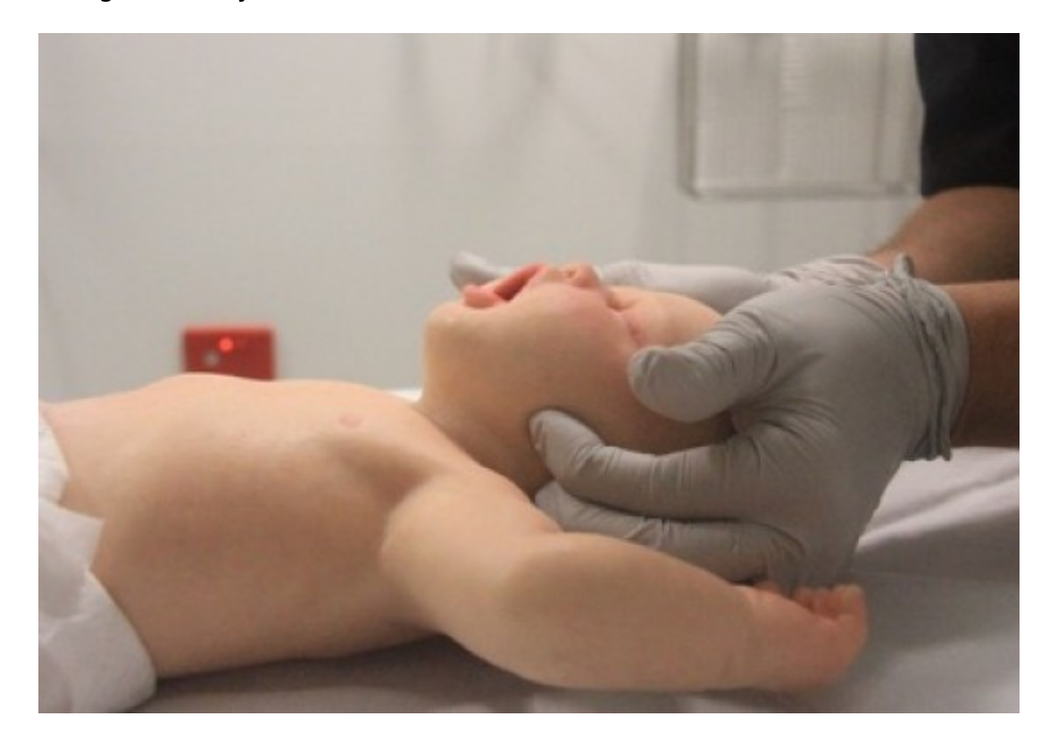
Figure 3: Jaw thrust in an infant